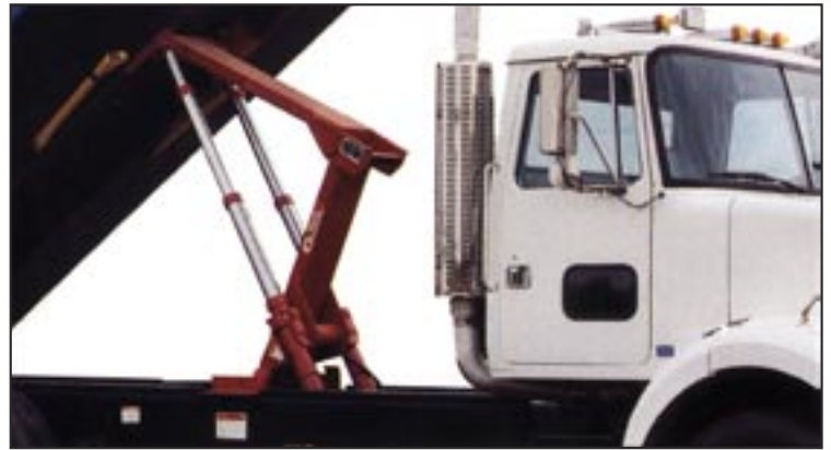
The 144 HD Hoist shown mounted with the hinge forward