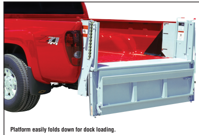
Platform easily folds down for dock loading.

All hydraulics and key electrical connections are completely enclosed.