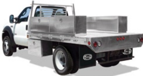
Aluminum "Badger" All Purpose Truck Bodies

The Omaha Standard quality truck equipment line includes e-coated stake bodies, service bodies, platforms, dump bodies, line bodies, contractor bodies, liftgates, grain bodies, and aluminum badger bodies. We also manufacture an outstanding line of low profile scissor and twin telescopic Olympic underbody hoists. Our equipment is sold and serviced by authorized Omaha Standard distributors who make it their business to see that you receive the finest equipment on the market and the best in installation and service.