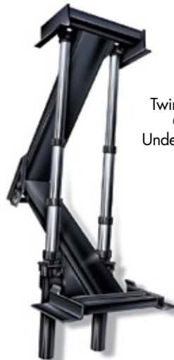
Twin Telescopic Olympic Underbody Hoists